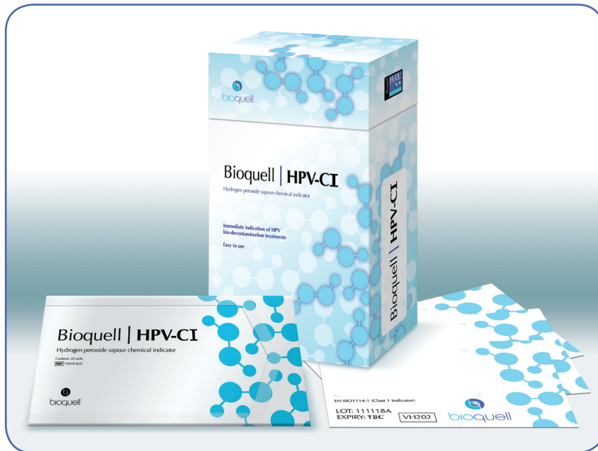
Image 1. Bioquell HPV-CIs provide a simple, easy to use indication of a successful Bioquell HPV bio-decontamination process

Bioquell HPV-CI is a simple visual indicator of the effectiveness of a Bioquell hydrogen peroxide vapour (HPV) bio-decontamination cycle. It has been developed to complement standard biological indicators*.