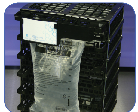
Image 3. After a Bioquell HPV bio-decontamination, the colour of the indicator portion can be used to provide an early indication of the reduction in bioburden (e.g. >6-log)