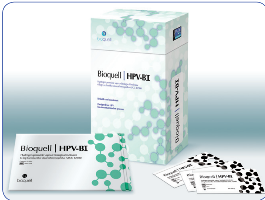
Image 1. Bioquell HPV-BIs provide assurance of a 6-log reduction in bioburden

Biological Indicator Type: 6-log Geobacillus stearothermophilus ATCC 12980